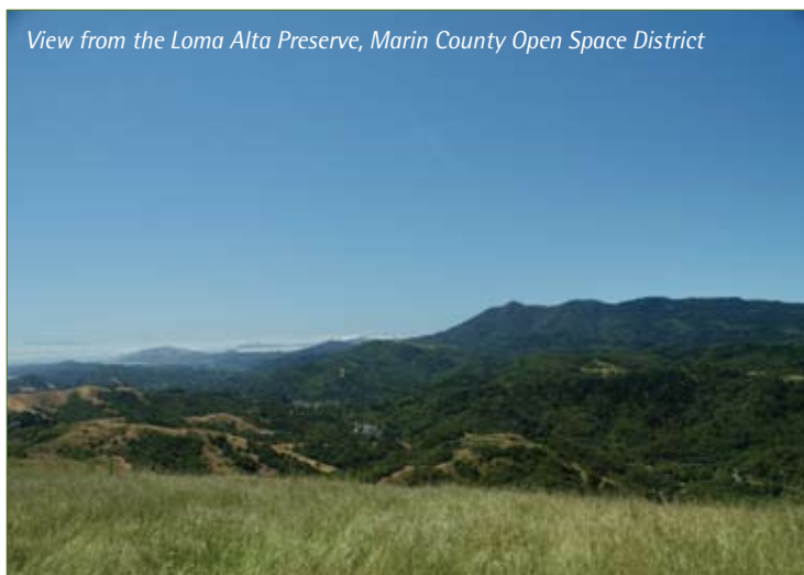
View from the Loma Alta Preserve, Marin County Open Space District