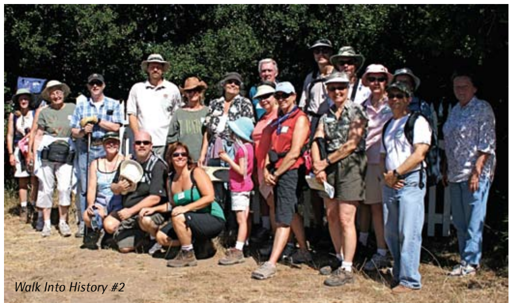
Walk Into History #2