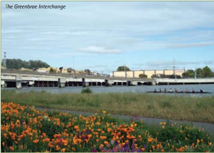
The Greenbrae Interchange