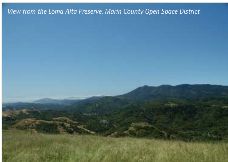
View from the Loma Alta Preserve, Marin County Open Space District