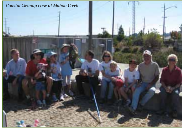
Coastal Cleanup crew at Mahon Creek

Initiated an MCL Climate Action Committee to ensure that issues associated with energy, greenhouse gas emissions, waste, and climate change are considered in MCL's actions and positions.