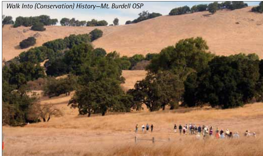
Walk Into (Conservation) History—Mt. Burdell OSP

MCL's 2010 Walks into (Conservation) History, initiated in 2009 during the League's 75 th Anniversary year, continued to attract large and enthusiastic groups of walkers and conservation history buffs. At the March Walk into the Corte Madera Shoreline , more than 60 people heard about successful efforts to save Heerdt Marsh, and the story of restoring the diked Muzzi property to tidal action in 1976 as mitigation for construction of Golden Gate Bridge District's Larkspur Ferry Terminal. In August, another large crowd walked into Gerbode Valley above Rodeo Lagoon and visualized how the vast " Marincello " development could have transformed the Marin Headlands had not lawyers persisted in challenging the County's approval of the development in 1965. The Valley is now undergoing extensive restoration to eradicate invasive non-native vegetation. Mt. Burdell was the location of the series' 6 th Walk. Destined in the early 1970s to be covered with residential development, the south and east-facing slopes of the mountain offer expansive views of San Pablo Bay and beyond. Although much of Mt. Burdell is now protected in the County Open Space Preserve and by the State (Olompali State Historic Park), private lands remain under threat. MCL continues this popular series in 2011 and 2012.